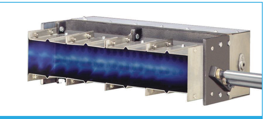
FIGURE 2. In a low NO_x line-style burner, the cut-outs and holes in the mixing plates cause the air and fuel to mix thoroughly, ensuring as uniform combustion as possible.

For applications requiring higher temperatures, one common method to reduce NO_x is through the use of flue-gas recirculation (FGR), which is illustrated with the red arrows in figure 3. Some self-recuperative burners have a uniquely designed internal combustor that draws exhaust gases back into the flame to cool it, lowering ther-