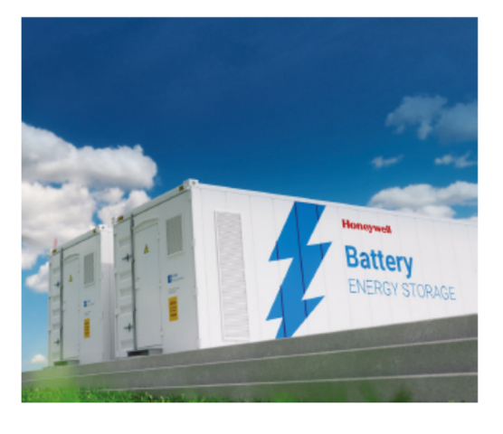
Figure 2: Industrial sites can maintain redundancy as the GT-BESS system operates in parallel with the gas turbine as a hot standby.

With Honeywell's approach, a remote operating site can maintain redundancy as BESS operates in parallel with the GT as a hot standby. Should the operating turbine trip, the BESS seamlessly takes over the baseload to avoid any power disruption. The system enables restarting of the tripped GT or back-up power and then returns to the normal operating regime.