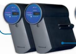
IO Modules: SPM, SVPM, UIO-2, Series C IO