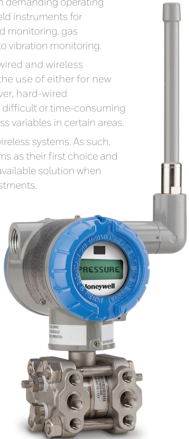
Honeywell SmartLine Wireless Pressure Transmitter