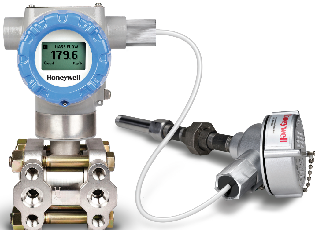
Honeywell SmartLine Multivariable SMV800 Transmitter