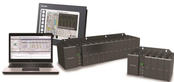
ControlEdge HC900 Control System

ControlEdge HC900 possesses a flexible architecture that can accommodate the most demanding application, and with its advanced features and versatile connectivity, is capable of customized pinpoint control.