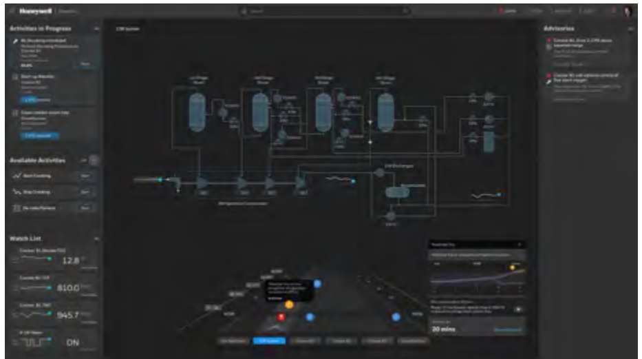
Fig 1. Experion® Operations Assistant Runway.

This feature presents a dynamic, at-glance visualization of scheduled and predicted events categorized by process area and asset. It highlights scheduled activities and potential anomalies, complete with alerts for deviations and alarms. Operators are empowered to help identify issues before they escalate, enabling them to prioritize actions that prevent upsets and minimize downtime.