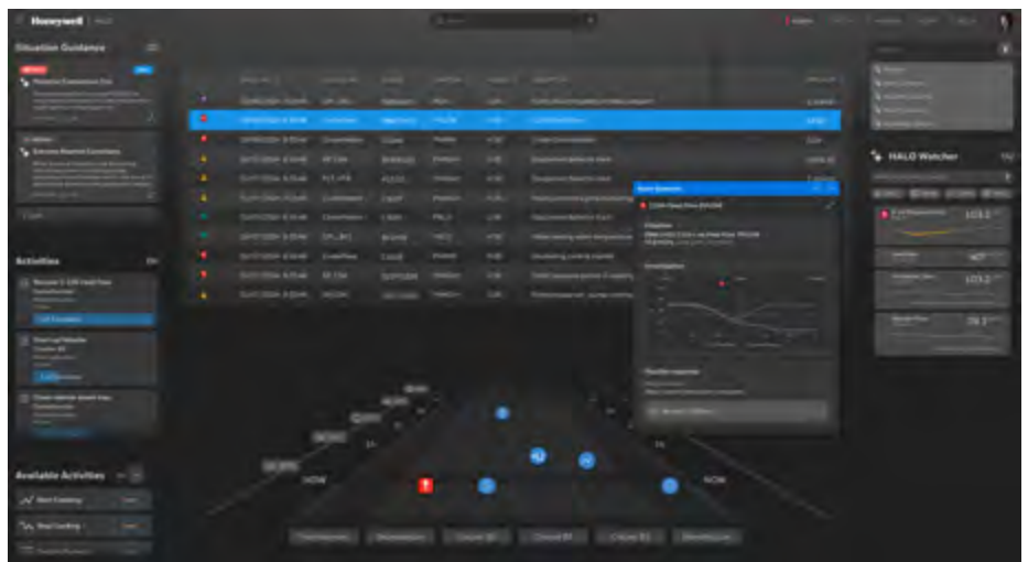
Fig 2. Alarm Assistance and Situation Guidance.

Leveraging historical data and real-time analysis, this tool enhances alarm response effectiveness and speed. In-built analytics provide a contextualized view of pertinent information, displaying all relevant data on the screen, including critical parameters and upstream or downstream impacts, thereby supporting improved decision-making.