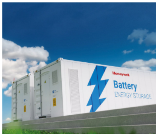
Figure 1: Honeywell's Renewable Energy solution is designed to hybridize power supply capabilities through the use of an advanced BESS and Solar PV technologies.

Honeywell's solution is specifically designed to increase the use of renewable energy in a remote, off-grid environment. It hybridizes power supply capabilities through the deployment of advanced BESS and Solar PV technologies—reducing the need to rely on non-renewable energy generators, while improving reliability of the power supply and reducing overall costs.