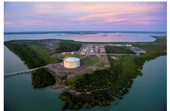
Leading miners and O&G producers are seeking to transition from a traditional power supply based on diesel or gas to a hybrid power generation solution.

By minimizing diesel fuel consumption, industrial firms can reduce their operating costs and lower their carbon emissions. Corporate goals for carbon reduction are taking on greater importance as organizations strive to extend their green energy initiatives.