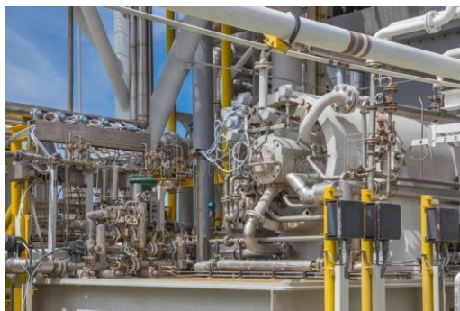
Figure 1: Site operators that are able to shut down one gas turbine can save a significant amount of fuel through lower “idling” consumption.

However, the latest innovations in BESS technology offer the same, if not more, reliable power with higher efficiency and lower emissions.