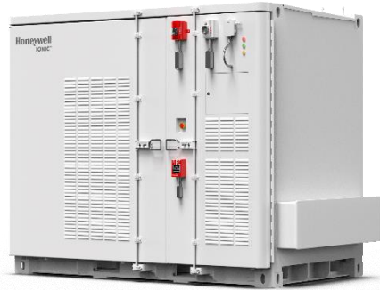
Figure 2: Industrial sites can maintain redundancy as the GT-BESS system operates in parallel with the gas turbine as a hot standby.

With Honeywell's approach, a remote operating site can maintain redundancy as BESS operates in parallel with the GT as a hot standby. Should the operating turbine trip, the BESS seamlessly takes over the baseload to avoid any power disruption. The system enables restarting of the tripped GT or back-up power and then returns to the normal operating regime.